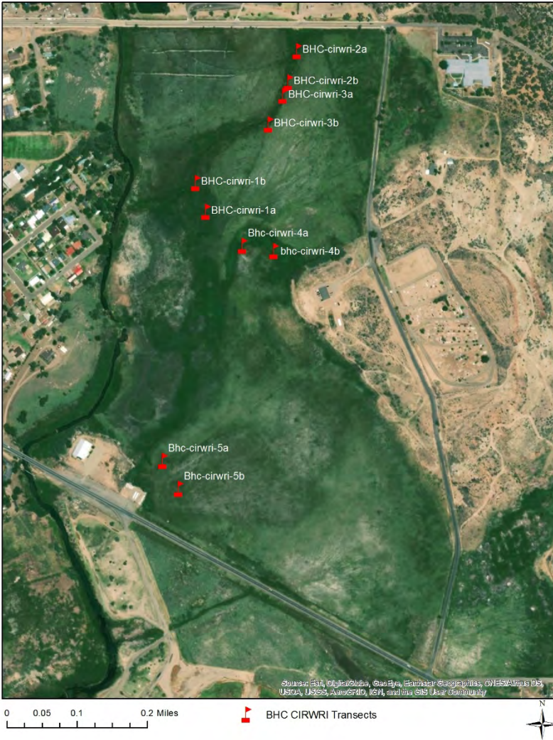
Figure 3. Location of Cirsium wrightii monitoring transects on Blue Hole Ciénega in Santa Rosa, NM.