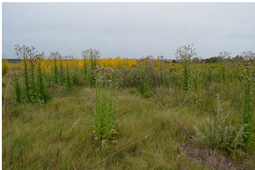
Figure 2. Habitat of Cirsium wrightii at Blue Hole Ciénega in Santa Rosa, NM ( Helianthus paradoxus in the background).

Cirsium wrightii is found in wet, alkaline springs, seeps, and marshy edges of streams and ponds between 3,450 and 8,500 ft (NMRPTC 1999). It is found in Eddy, Chavez, Guadalupe, Otero, Sierra, and Socorro countries in New Mexico. In the Santa Rosa wetland complex plants occur scattered within an assortment of marshes, spring seeps, streams, and along the margins of various sinkhole lakes (USFWS 2015; Figure 2).