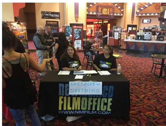
Century Rio 24 and XD, Albuquerque