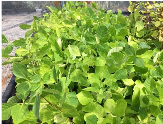
Rio Grande Cottonwood