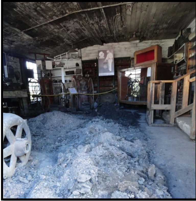
Figure 9. Clean-up of gob blowout debris in a Museum building, September 2013