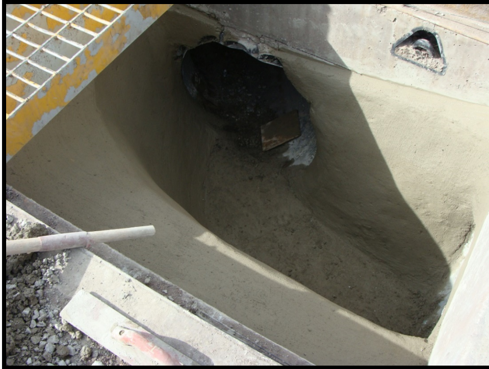
Figure 27. Newly cast grout infill to improve hydraulics in the lower NMDOT drop inlet in front of Mine Shaft Tavern, March 2015. Stormwater flows from right to left in this photo.