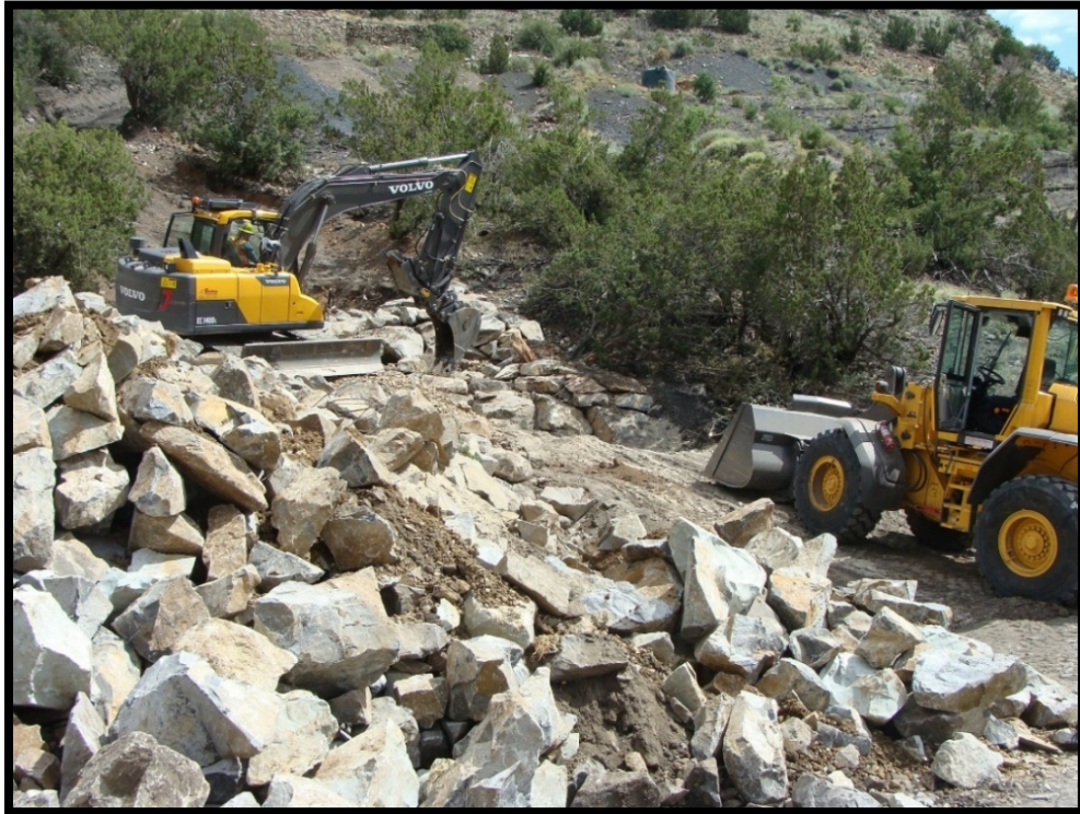
Figure 14. Constructing a machine-built, step-pool rock bypass channel around blown-out gob pile, July 2014