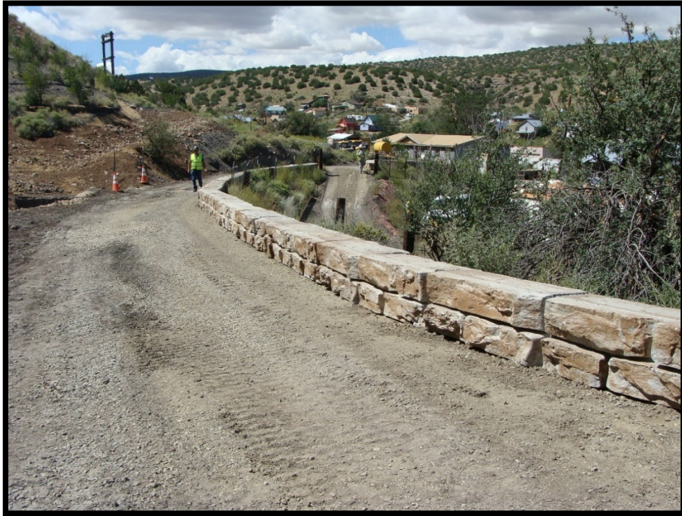
Figure 18. Precast architectural blocks for stormwater control, replacing temporary Jersey barriers, September 2014