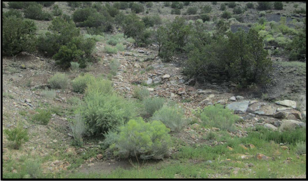
Figure 15. The completed step-pool rock bypass channel in August 2016. Note planted and seeded vegetation in and around the channel. The large light colored rock was covered with smaller tan rock to better blend channels into the surroundings.