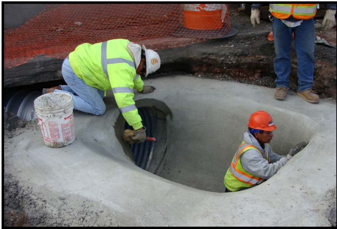
Figure 26. Casting new clean-out manhole immediately outside of the Mine Shaft Tavern (later capped with concrete slab with manhole ring and cover), March 2015