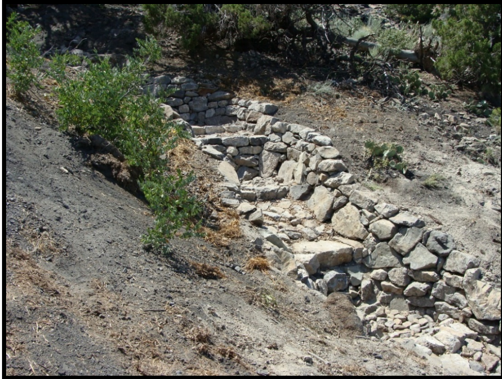
Figure 13. Hand-built step-pool rock channel at edge of larger gob pile, July 2014