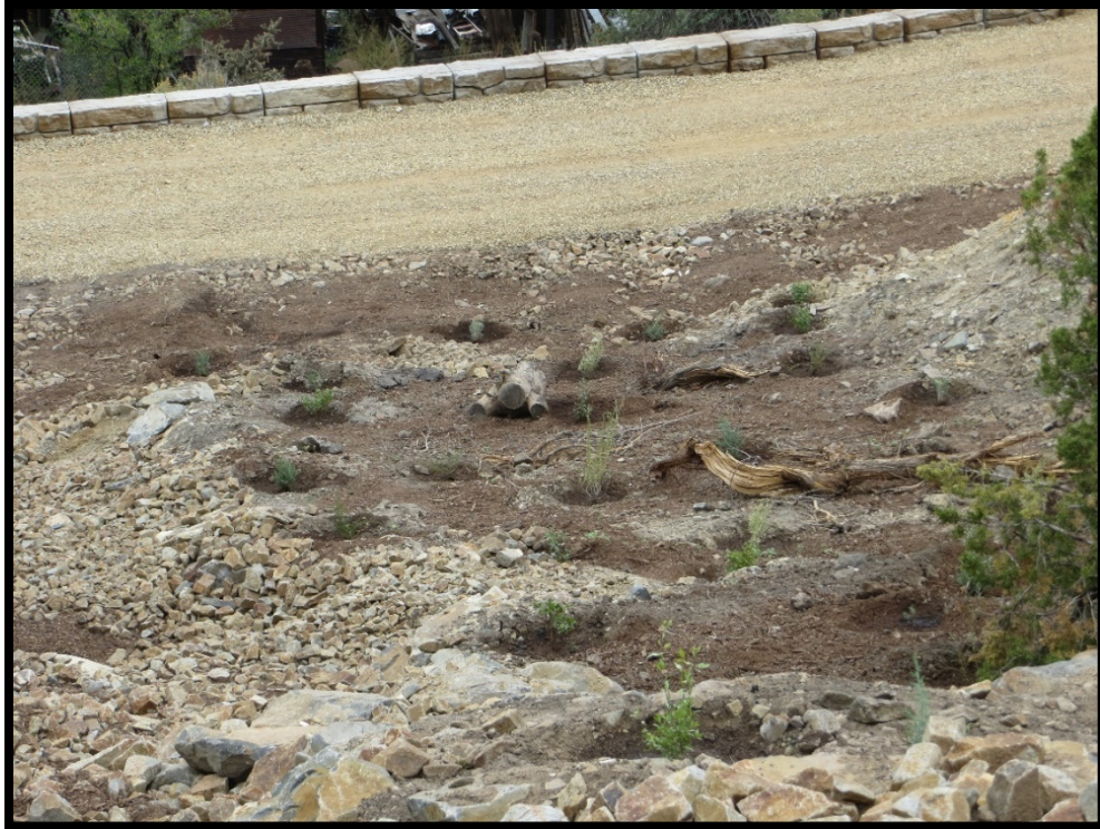
Figure 19. Newly planted native seedlings for slope stabilization, October 2014