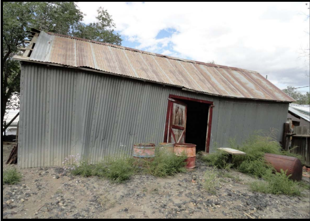
Figure 5. Coal debris damage to historical Museum building below eroded gob pile