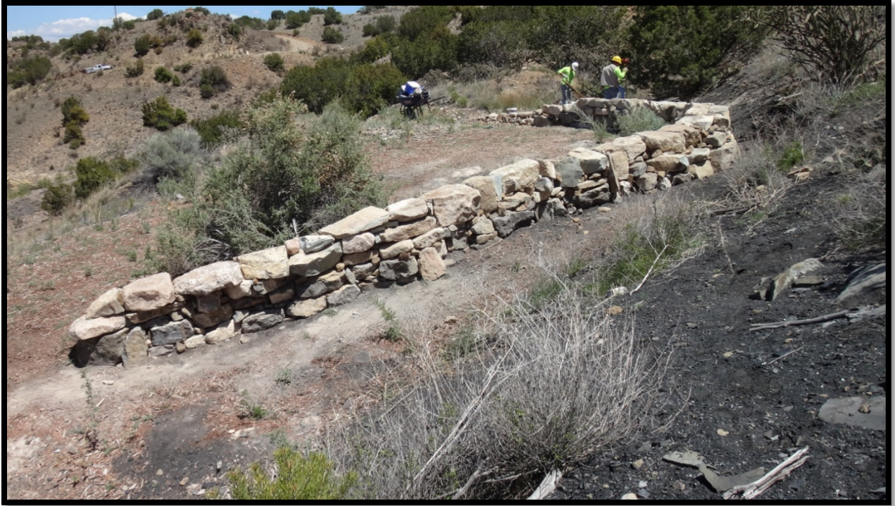
Figure 21. Raising of the dry stack rock wall to divert hillslope stormflows around the top of the larger reclaimed gob pile, May 2016