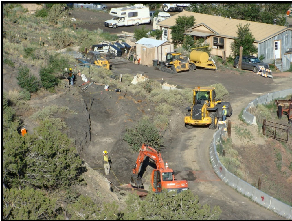
Figure 12. Working in tight quarters to construct a rock bypass channel, July 2014