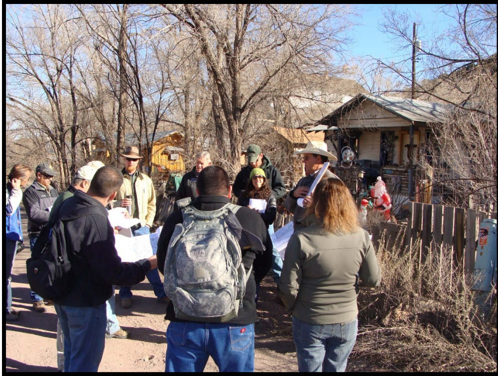
Figure 3. Community design workshop, December 2012