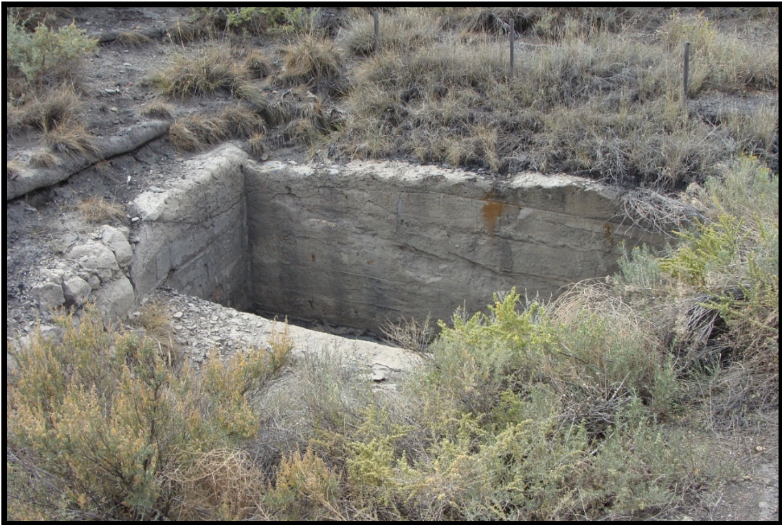
Figure 22. The derelict upper drop inlet below the gob piles and above the Museum before construction