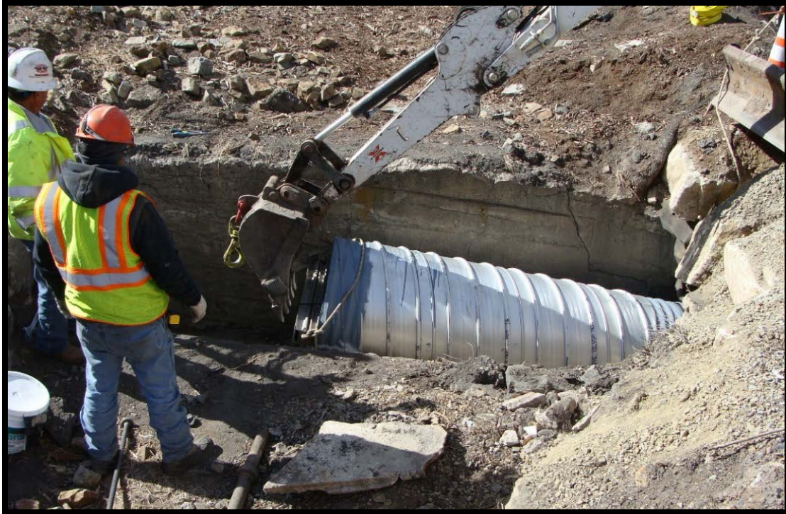
Figure 25. Sliplining 36-inch diameter steel pipe into the box culvert at the upper drop inlet, February 2015