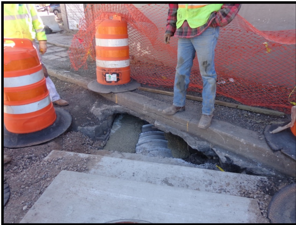
Figure 28. Grouting sliplined pipe into place, March 2015. Note fresh grout rising around the steel pipe and its location underneath the Mine Shaft Tavern.