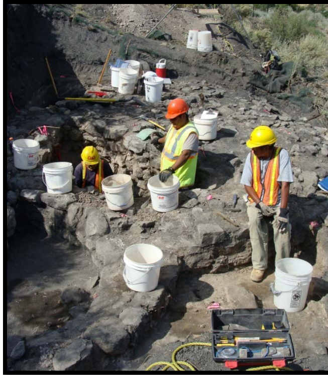
Figure 17. Archaeological excavation underway during construction, July 2014