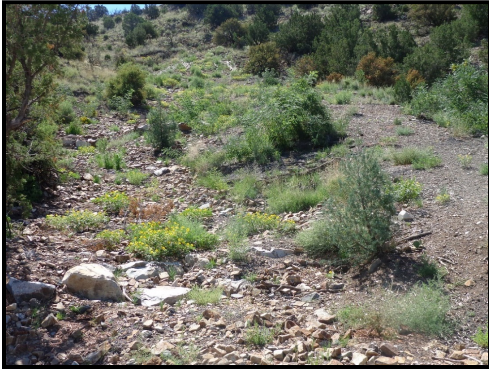
Figure 20. Rock diversion channel on left and smaller reclaimed gob pile on right one year after construction, August 2015