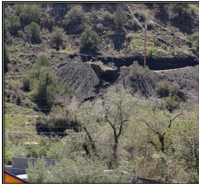
Figure 4. Deeply eroded gob pile above Museum and Icehouse Road. Precast barriers were placed along the driveway above the gob pile to divert runoff to the upper drop inlet.