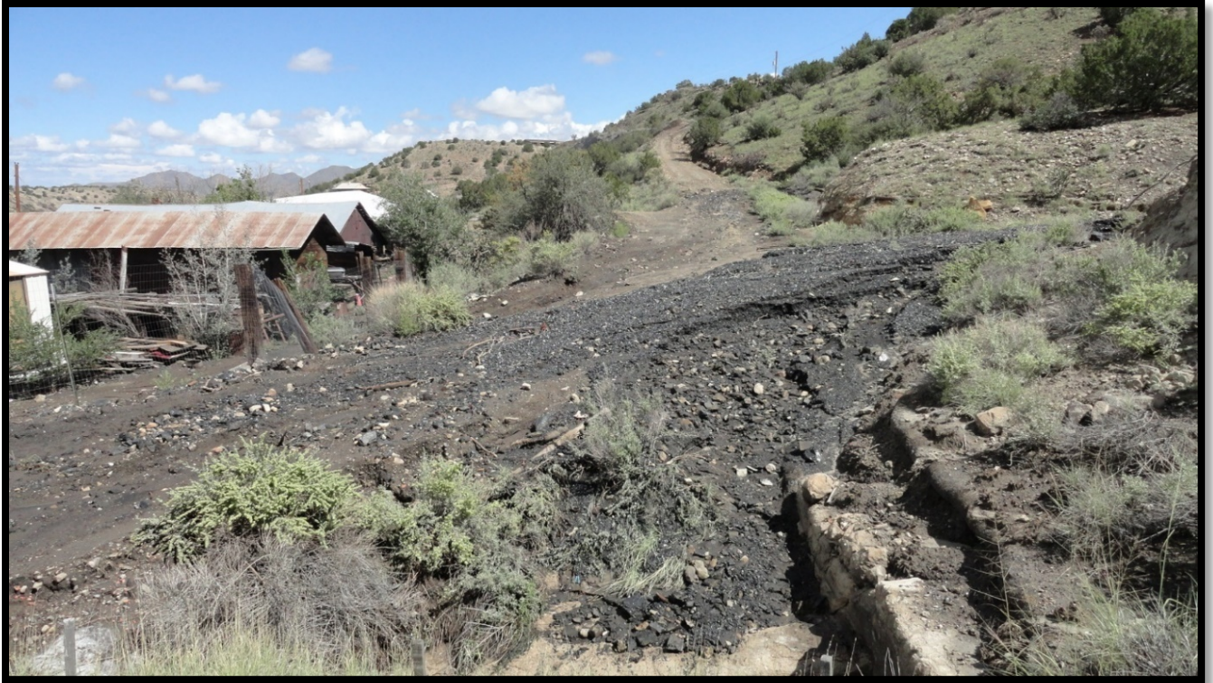
Figure 7. Debris flow from gob blowout across driveway and onto Museum property, September 2013