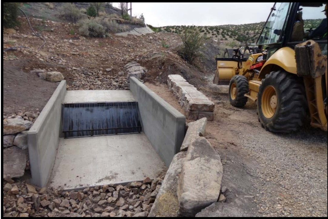
Figure 29. Reconstructed upper drop inlet, April 2015. Note the mulched rock diversion ditch behind the drop inlet in upper left of photo.