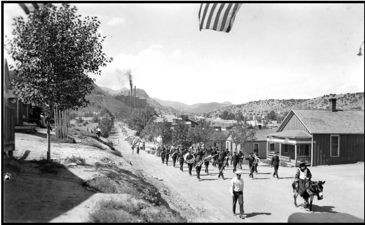
Figure 1. Fourth of July parade in Madrid with power plant and breaker in background, ca. 1930