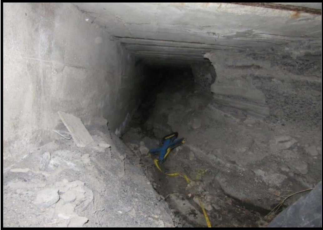
Figure 23. Storm box culvert below the upper drop inlet, clogged with coal mine waste debris before permanent reconstruction through sliplining