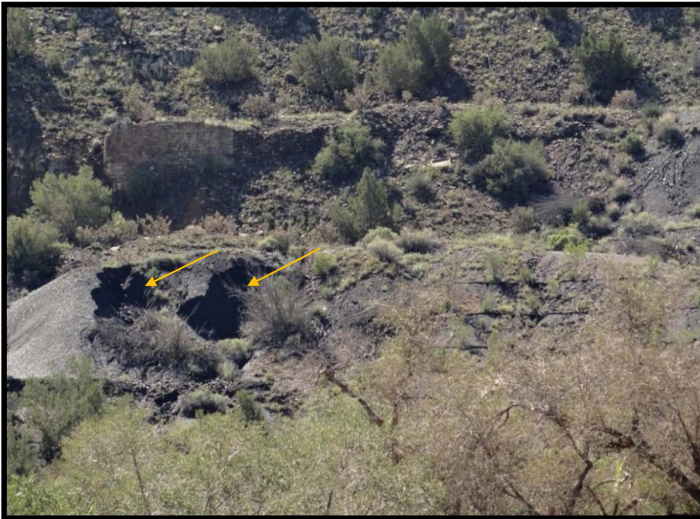
Figure 6. Arrows indicate the newly blown-out gob pile above the Museum, September 2013.