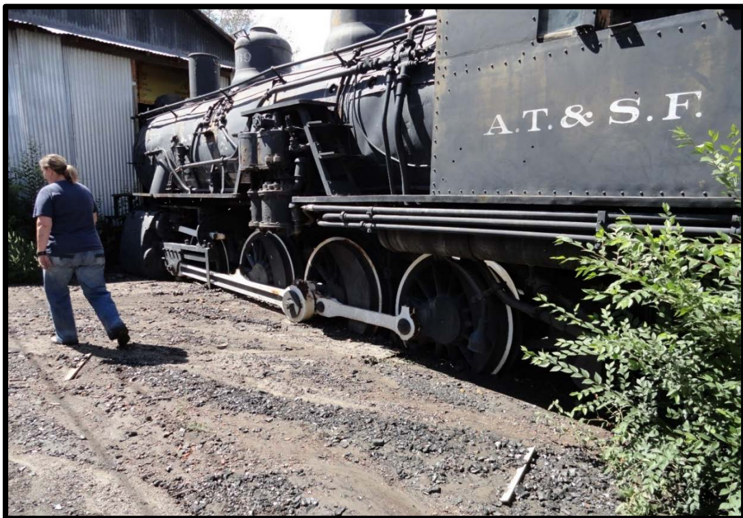
Figure 8. Gob blowout debris build-up against steam locomotive at Museum, September 2013