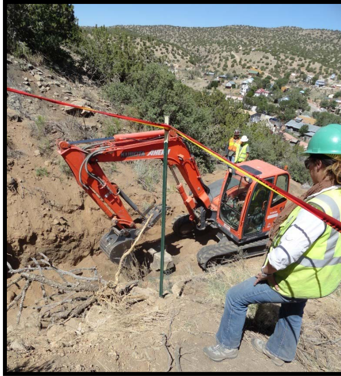
Figure 11. Backfilling the Cranky Charlie Coal Mine adit, June 2014