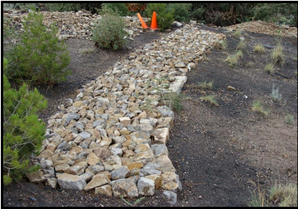
Figure 16. Newly constructed rock media luna on the larger gob pile to collect sheet flow, slow and infiltrate it, and direct it toward a rock mulch rundown below.