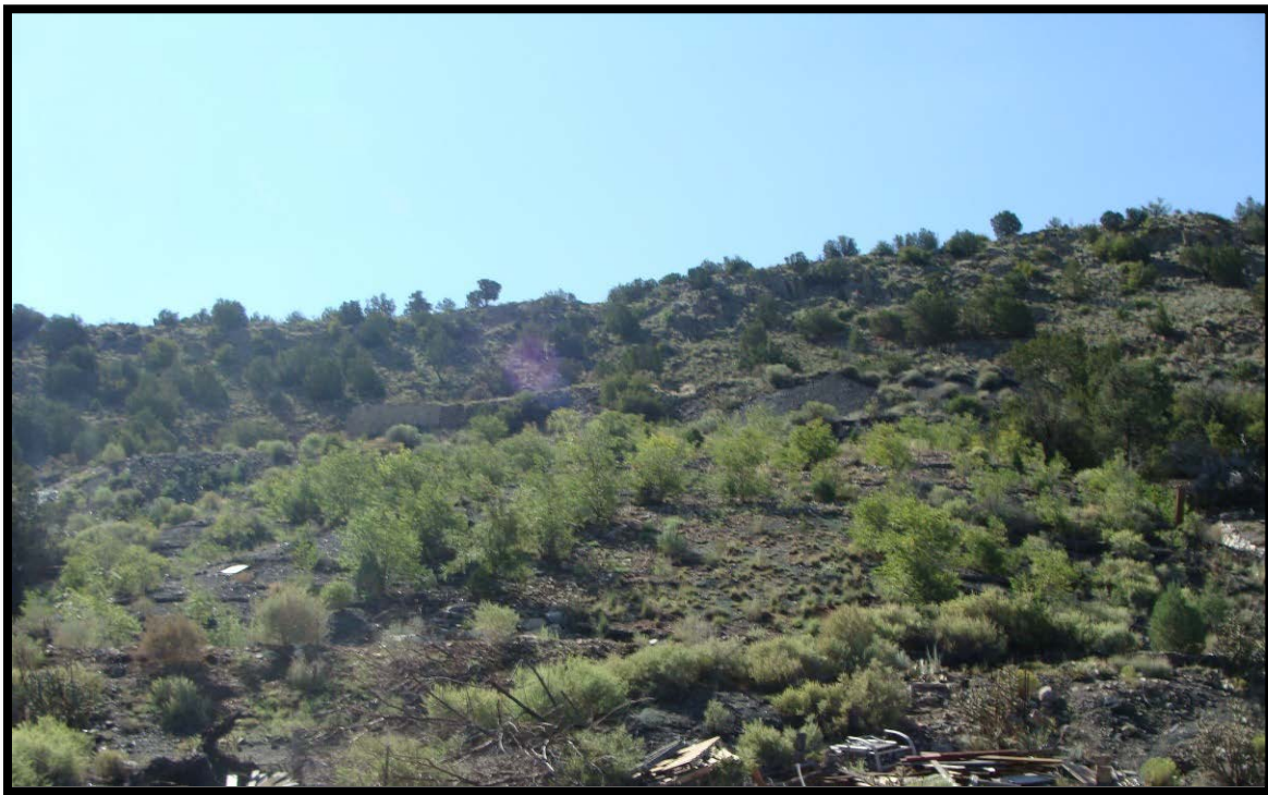
Figure 30. View of the larger reclaimed gob pile in August 2016, which was initially reshaped and reclaimed in 1999 and additionally stabilized in 2014