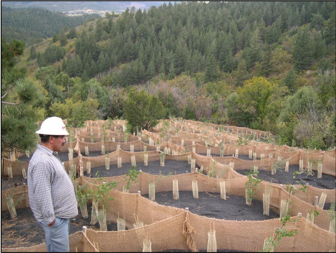
Sandy gob at the Sunset Mine, six months after seedling planting, October 2005. Cardboard tubes for seedling burial protection are visible inside the mesh tubes. Coir fencing runs north-south and east-west for seedling sun and wind protection.