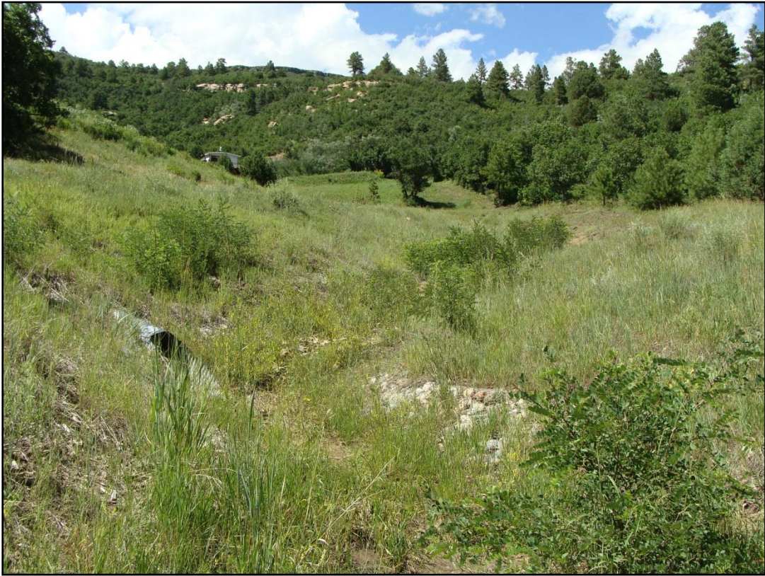
Vegetated gabion mattress at culvert outlet, August 2010