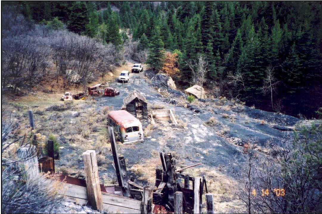
Sonchar Mine, April 2003. Note the timber loadout in the foreground. Abandoned vehicles were removed and recycled.