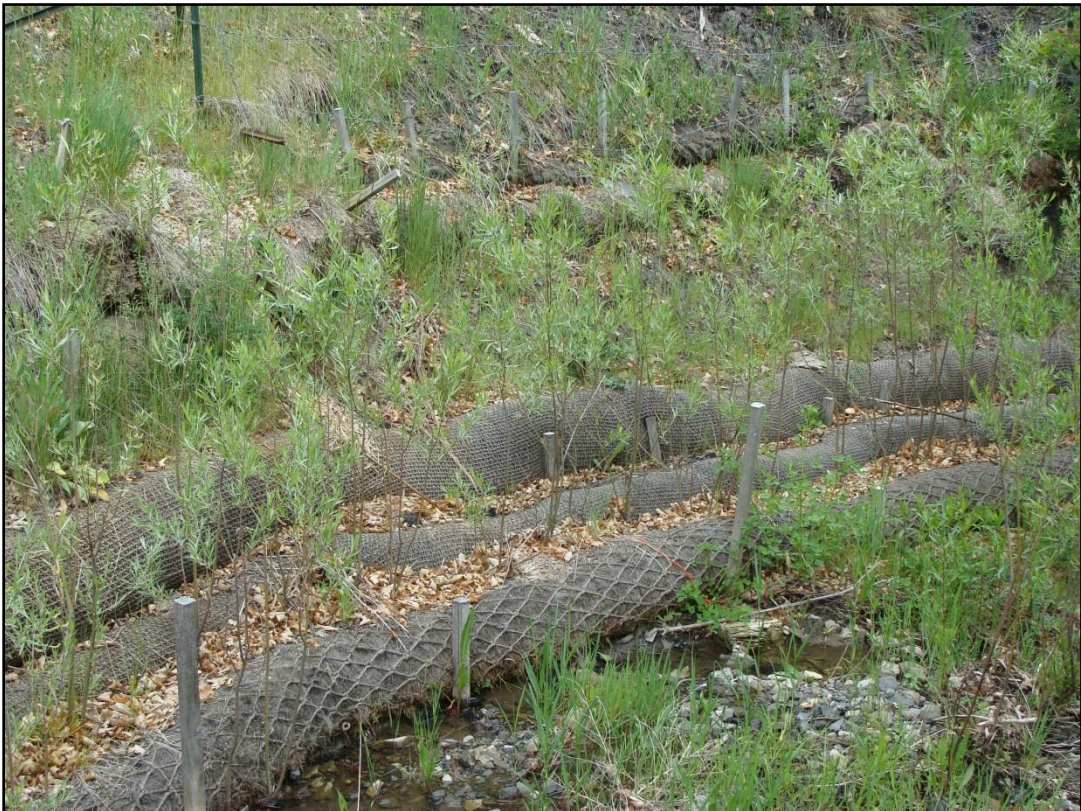
Willows at coir roll and coir blocks at the stream at the Sonchar Mine gob pile base, June 2009