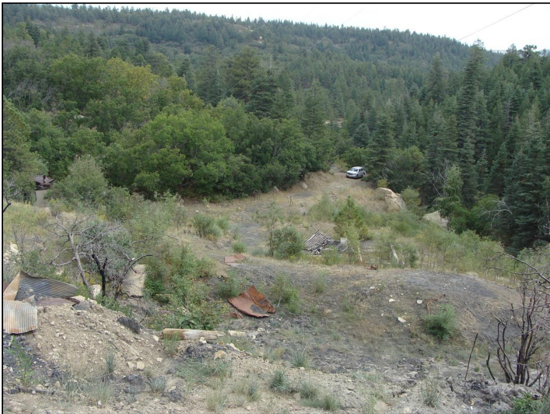
Sonchar Mine after a wildfire burned the timber loadout and area in foreground, Sept. 2012