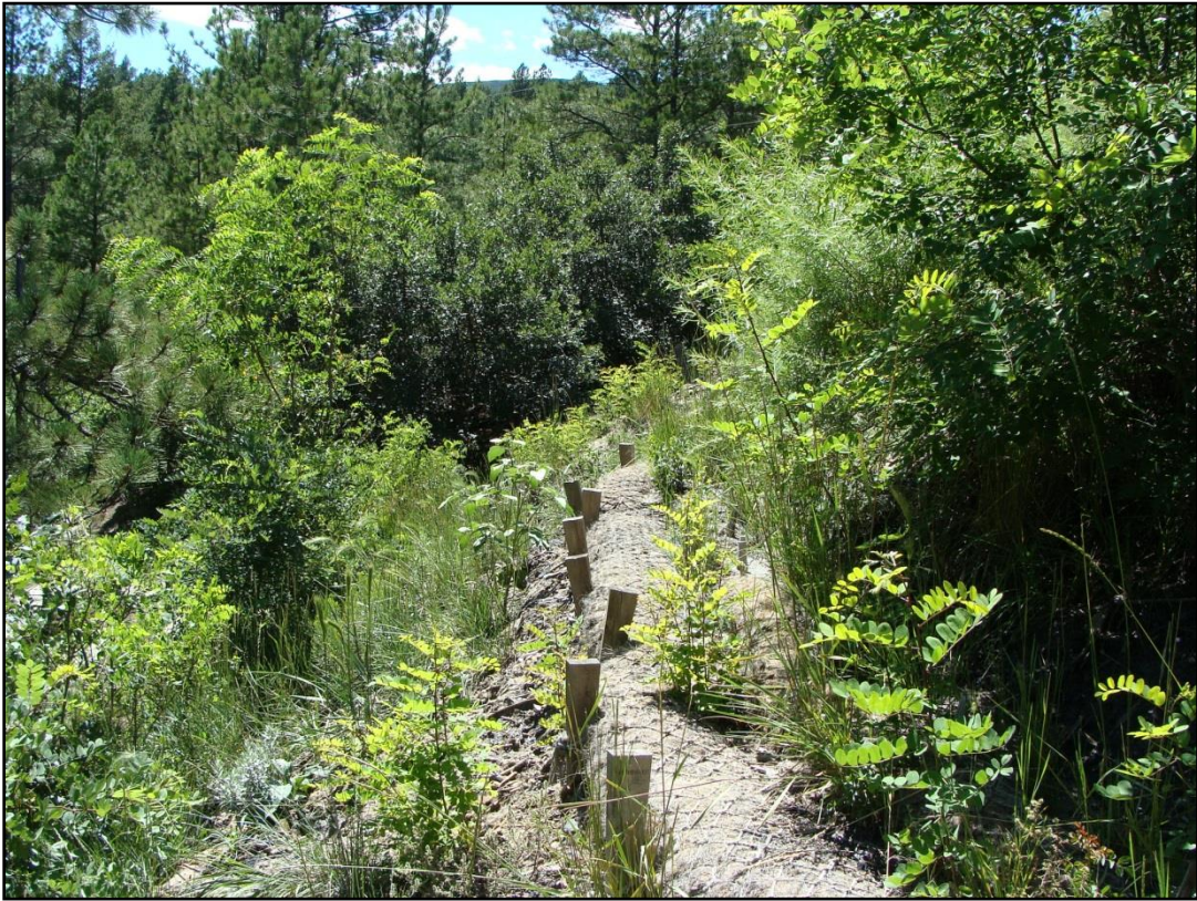
Hydroseeded slopes and plantings of native seedlings along coir rolls at one of the Franks No. 2 Mine steep gob piles reclaimed in-place, August 2010