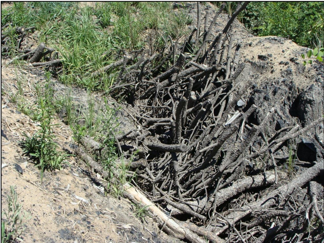
Branch packing of gully at a Franks No. 2 Mine gob pile, August 2010