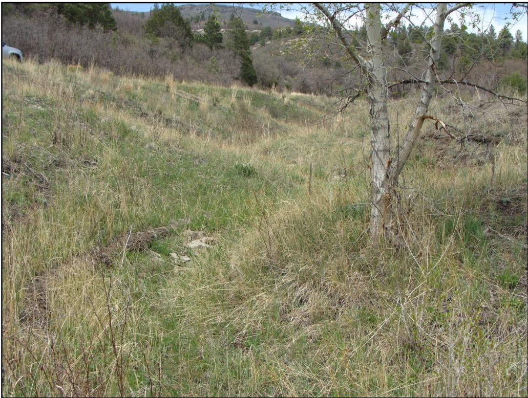
Near lower end of restored stream channel, looking upstream, May 2013