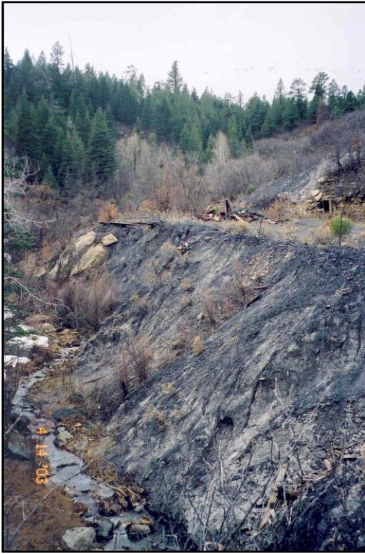
Sonchar Mine site and intermittent stream, April 2003