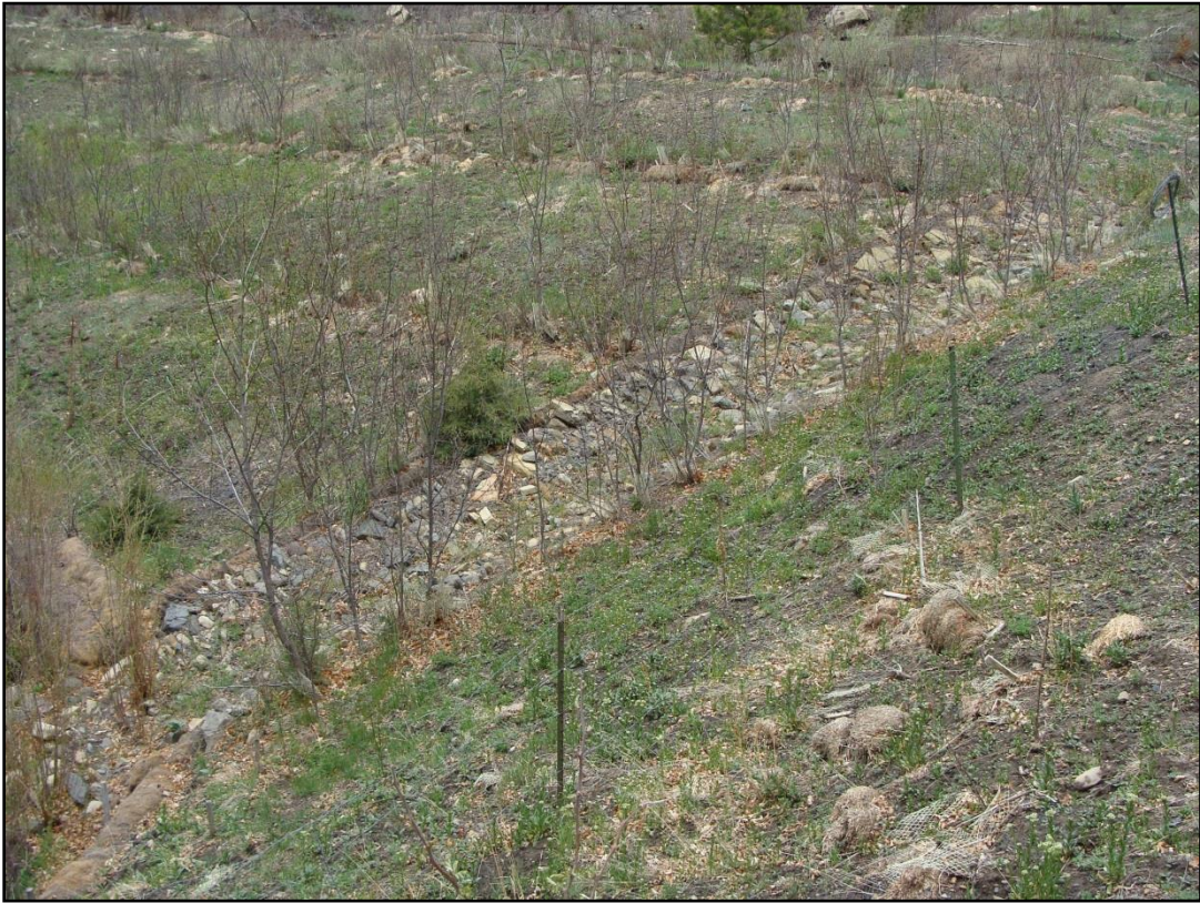
Rough-bed rock rundown at the Sonchar Mine site, May 2013. The trees planted along the rundown for root reinforcement and washout protection are just beginning to leaf out.