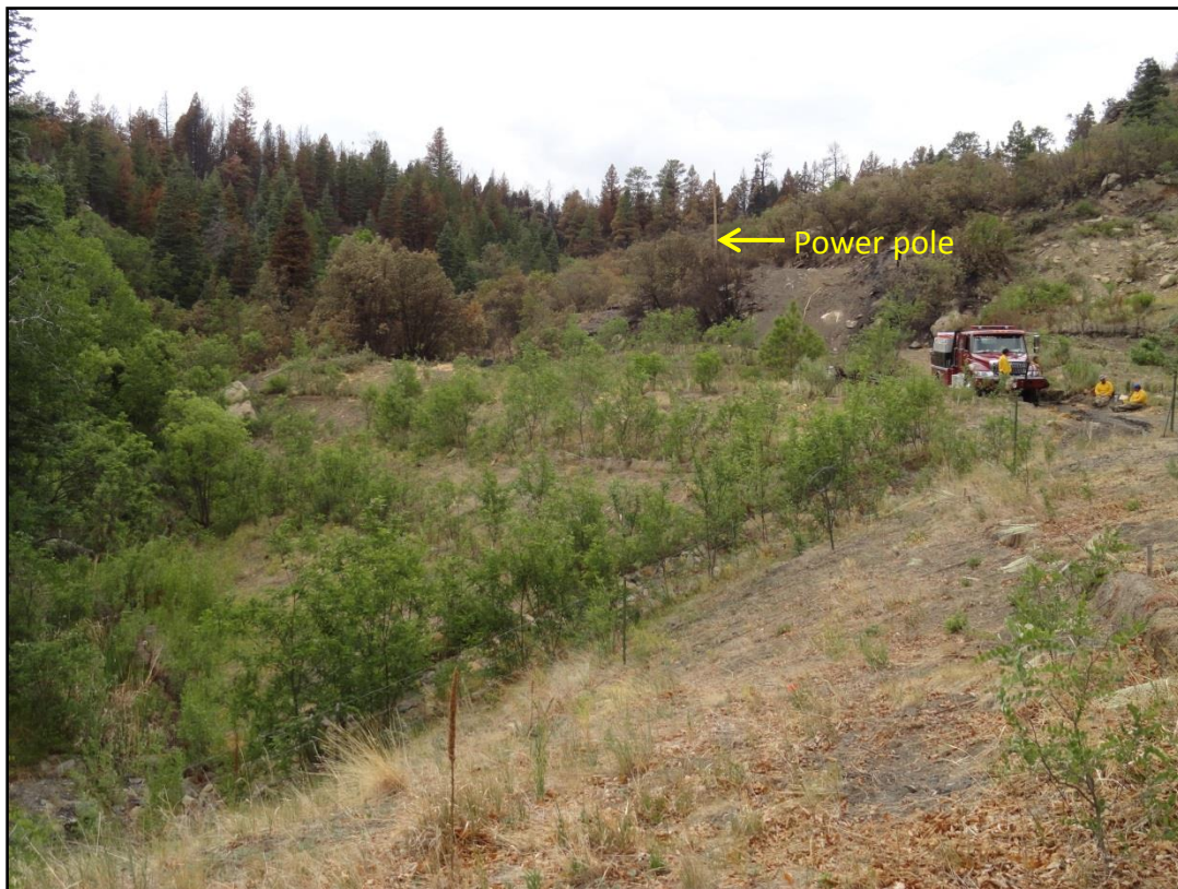
Sonchar Mine site immediately following the wildfire that burned across the northwest edge of the site, June 2011. A gob fire was ignited a few feet left of the power pole.