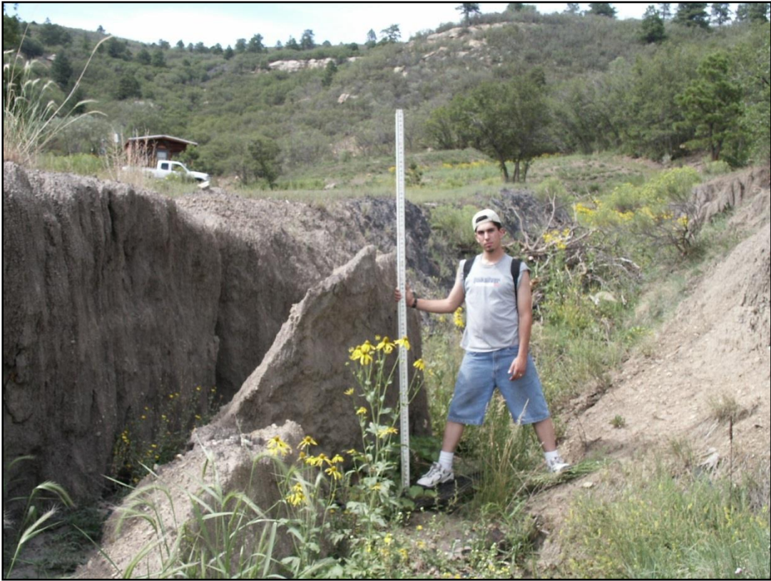
Incised stream channel at Franks No. 1 Mine, looking upstream, July 2002