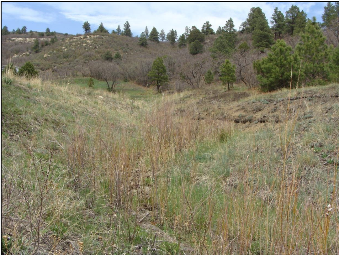
Restored stream channel with willows, May 2013