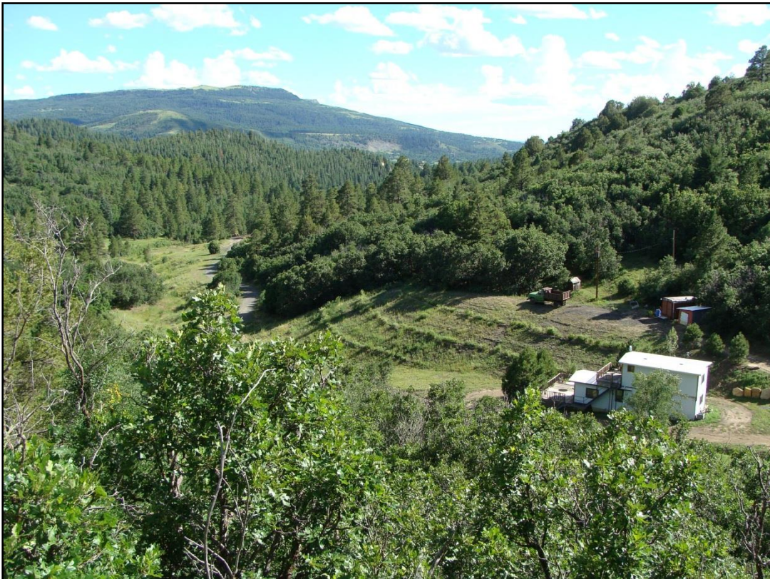
Franks No. 1 Mine site with re-graded gob piles and restored stream channel, August 2010