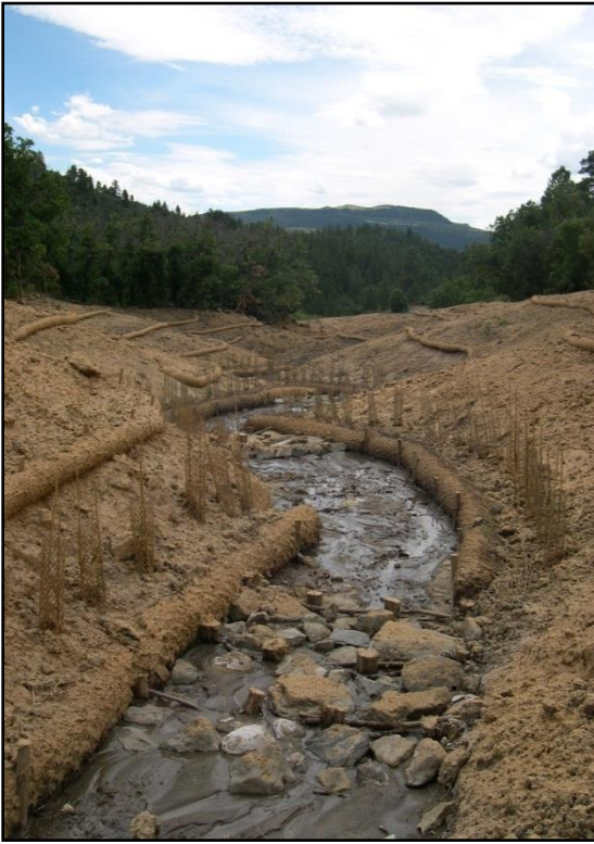
Newly installed wicker weir and coir rolls with native seedling plantings, 2005