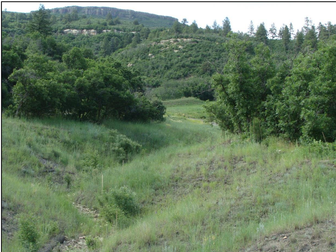
Restored stream, July 2009. Rock reinforcement added at two riffle points in fall 2008 is visible in lower left of photograph.