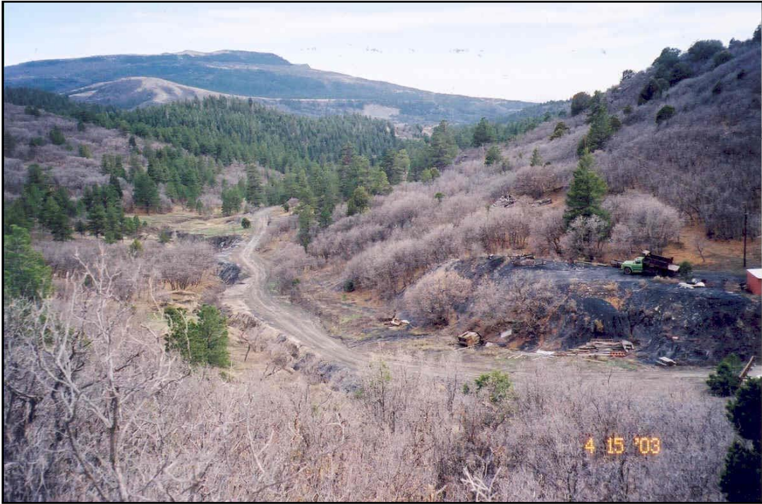
Franks No. 1 Mine site with gob piles and degraded, incised stream channel, April 2003