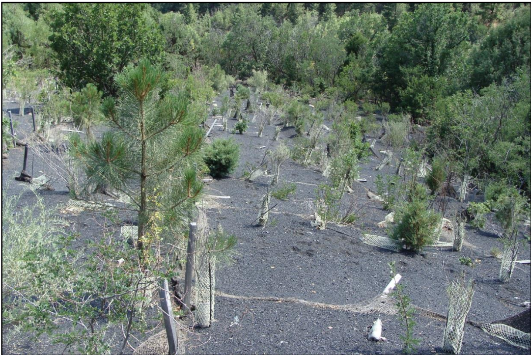
Sunset Mine gob pile, July 2011. Some cardboard tubes at plantings are still visible.