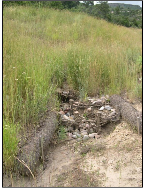
Headcut at wicker weir, 2007