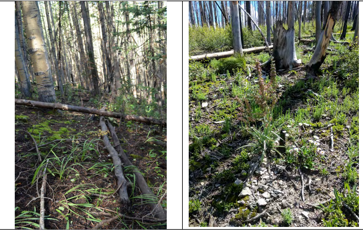
Figure 4. Typical growth form of Mogollon death camas in unburned and severely burned forest.