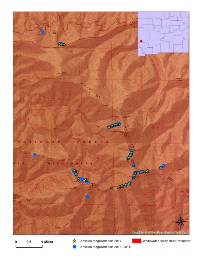
Figure 5. Mogollon death camas distribution in 2013 – 2015, and 5 years post-fire in 2017.