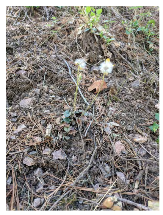
Figure 2. Typical heartleaf groundsel at North Fork Mineral Creek.

Plants were found extant at all previously reported sites in the North Fork of Mineral Creek but all were rated small, depauperate and drought stressed (Figure 2). The area burned light to moderately in 2012 and many plants were reported as drought stressed in 2015. One drought stressed site, Paccar-2015-1, reported thousands of plants in 2015 had 350 plants in 2018 (Paccar-1-old-2018). Three new sites were documented from a previously unsurveyed area.