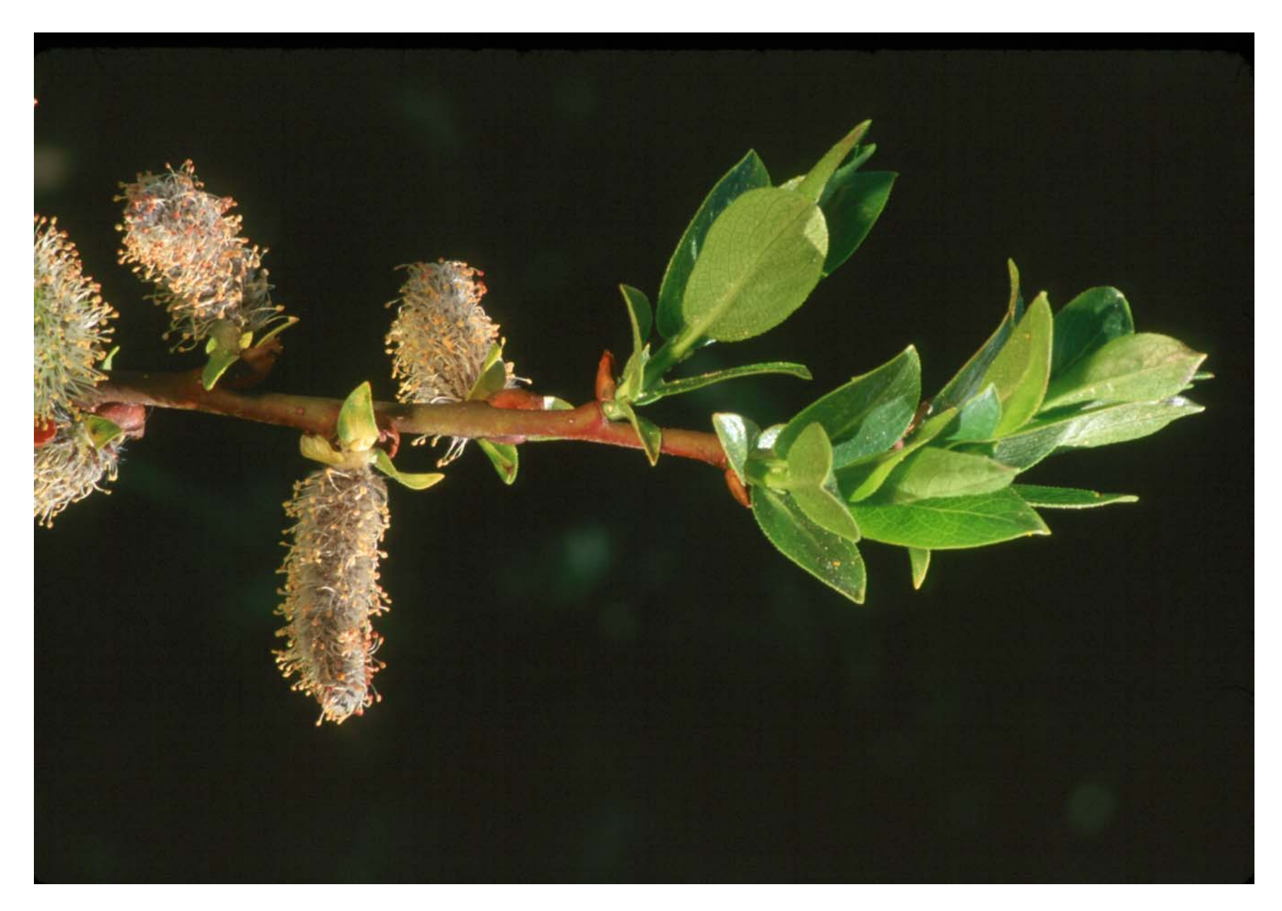
Photo 3. Arizona willow (Salix arizonica) with staminate catkins (male flower spikes). 18 June 2001, in 1958 exclosure.