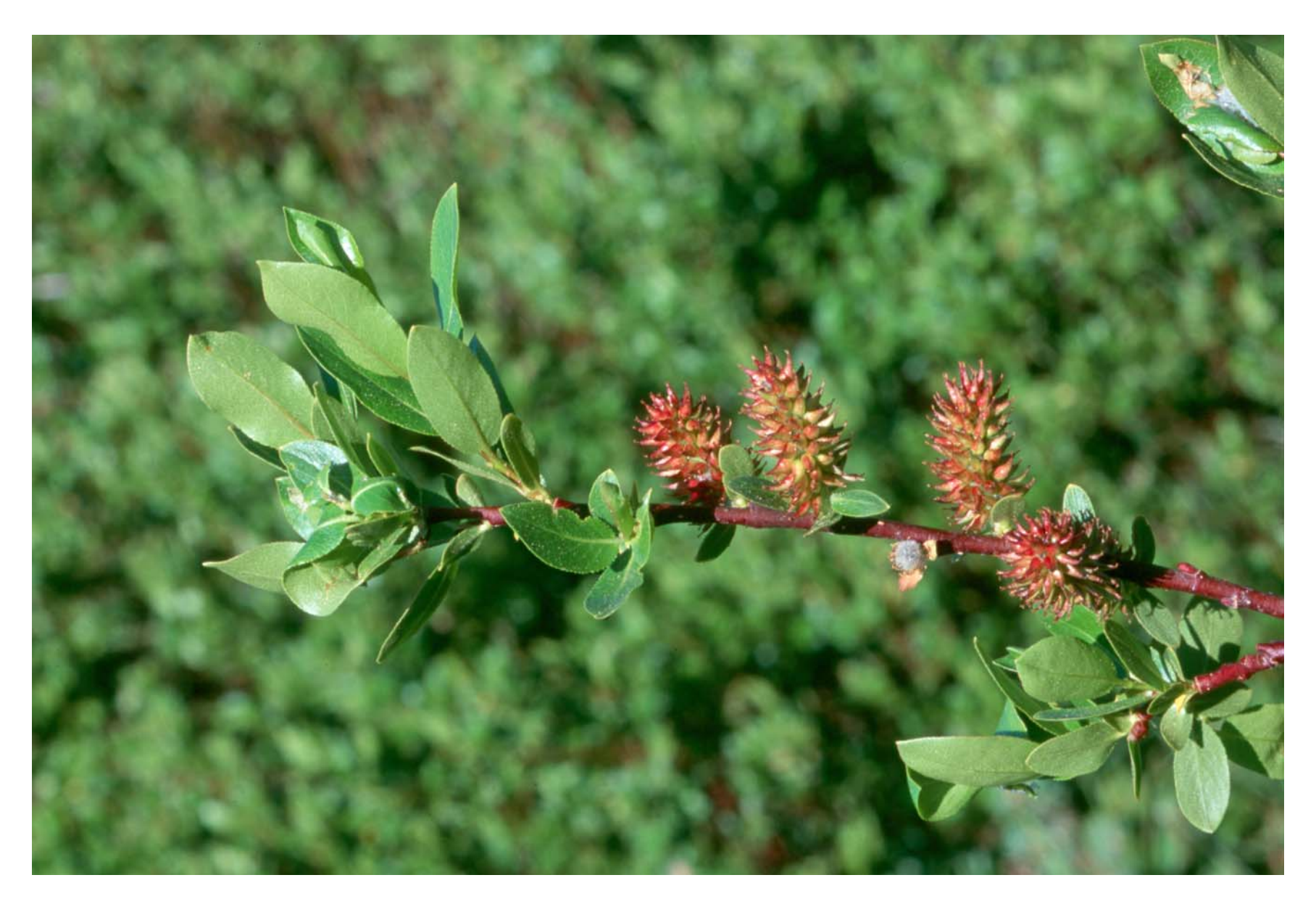
Photo 2. Arizona willow (Salix arizonica) branch with pistillate catkins (female flower spikes). 18 June 2001 in 1958 exclosure.