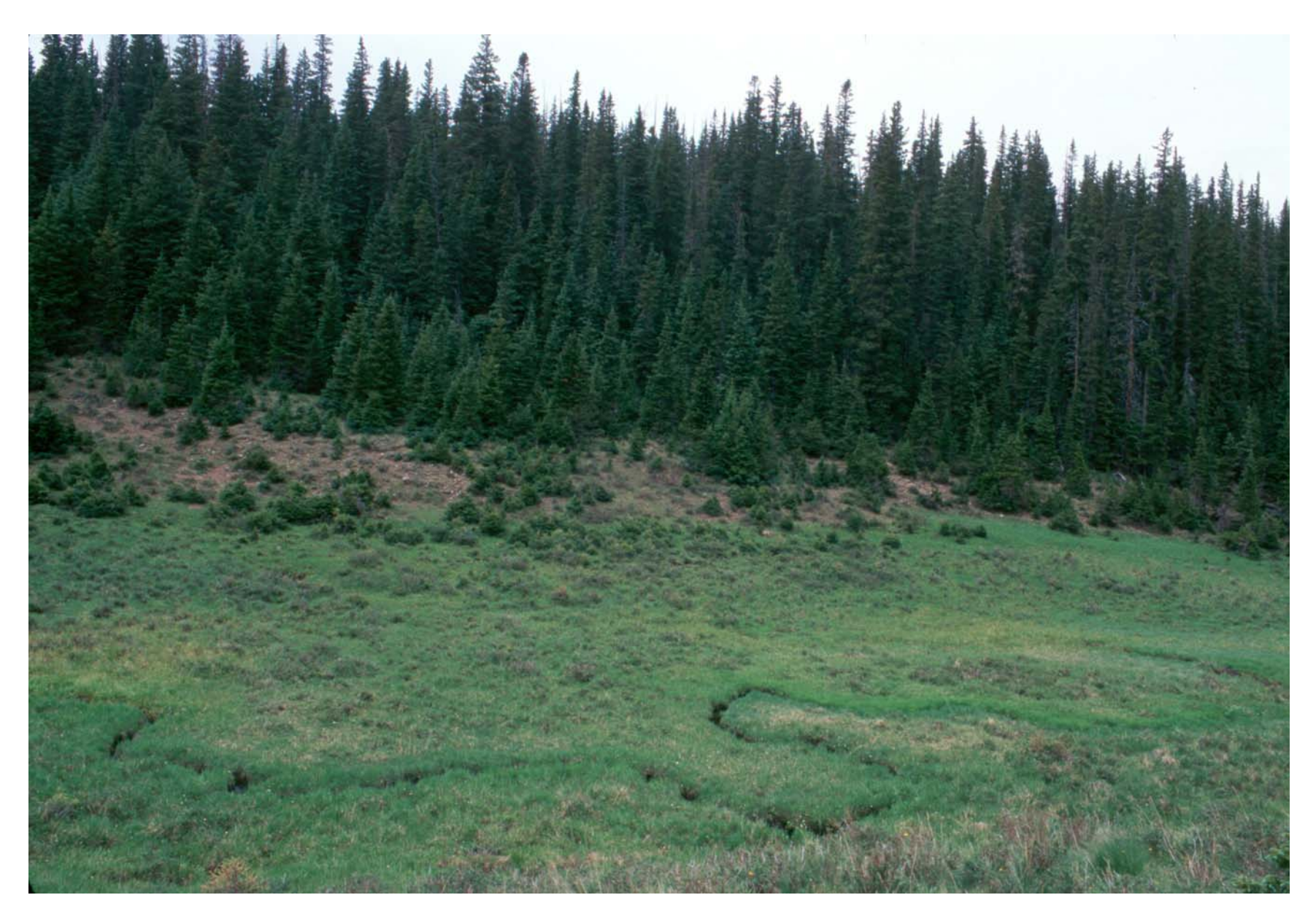
Photo 4.Arizona willow habitat along Sawmill Creek (Wheeler Peak Wilderness;site D7-12 in appendix 1). Area released from<br/>grazing for three years (George Long, Questa RD, pers. comm.). 23 June 2001.