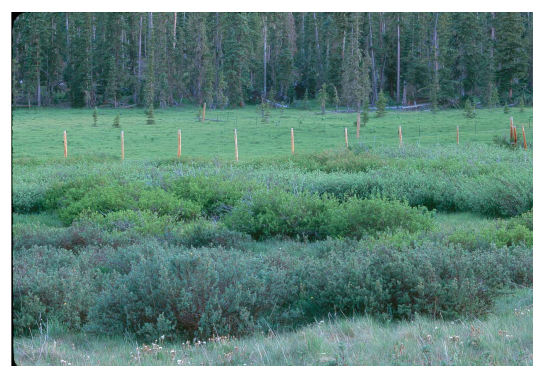
Photo 1. Photograph taken in cattle and elk exclosure erected in 1958 (site D7-7 in appendix 1), showing plant habit and habitat protection. Salix arizonica, (bright green; second row of shrubs), growing with shrubby cinquefoil ( Dasiphora floribunda ; foreground), and diamondleaf willow ( Salix planifolia ; pale green; third row of shrubs). Exclosure fence is ca. three meters tall.